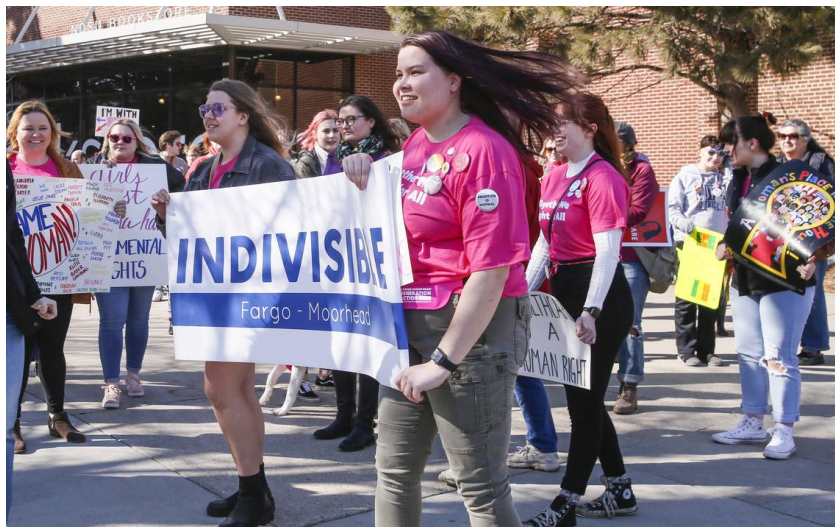
Indivisible Fargo-Moorhead holds their sign up to start the local Women's March Saturday, March 7, which began at the North Dakota State University Memorial Union.

“It's 2020,” she said. “People don't take BS anymore.”