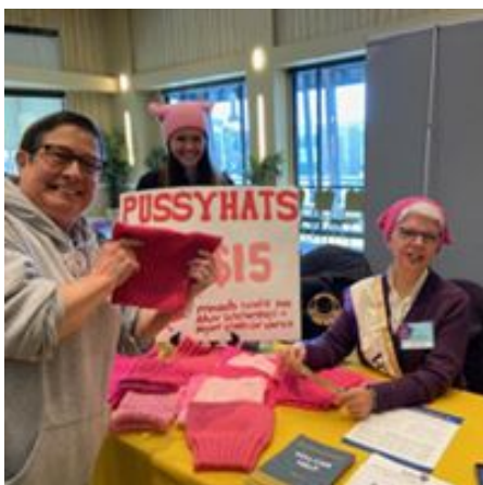
Happy customers at the FM Women's March helped the chapter raise $250 which will go to national AAUW for scholarships.