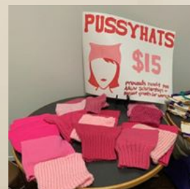
On a cold Saturday in January, members and friends of FM AAUW gathered at Thunder Coffee to create pussy hats as a fund raiser.